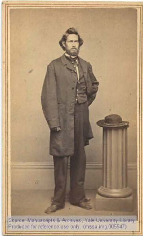
Produced for reference use only. (mssa.img.005547)